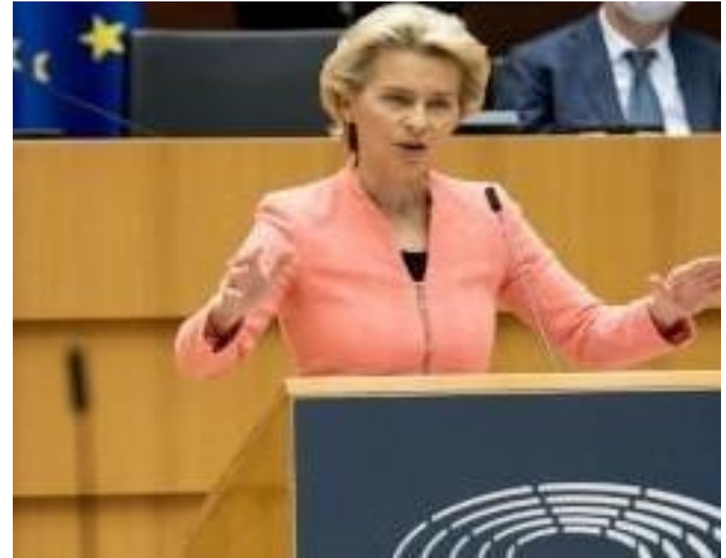
State of the Union Address by Ursula von der Leyen at the European Parliament 16 September 2020